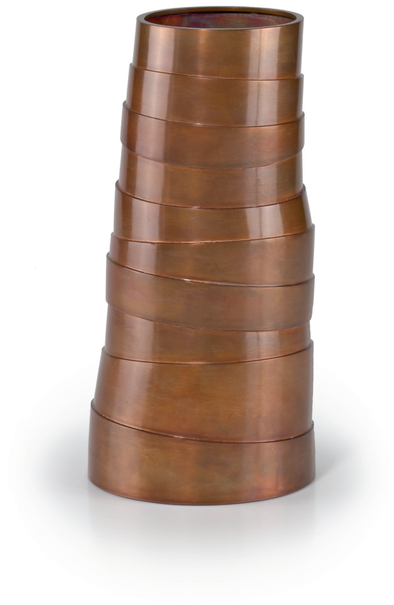
vase, tombac, h 20 cm