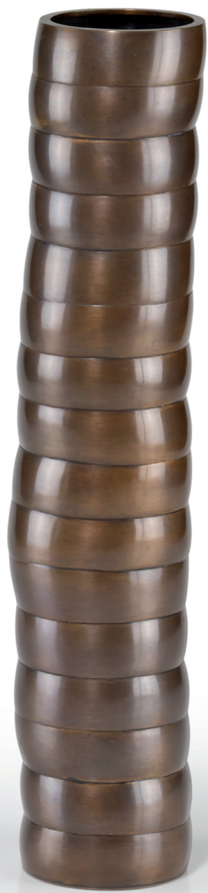
vase, tombac, h 30 cm