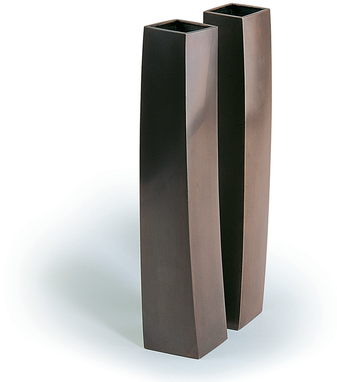
vases, tombac, h 30 cm