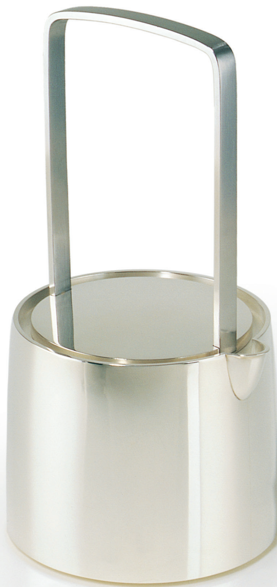
tea pot, silver, stainless steel handle, h 25 cm, ø 12 cm