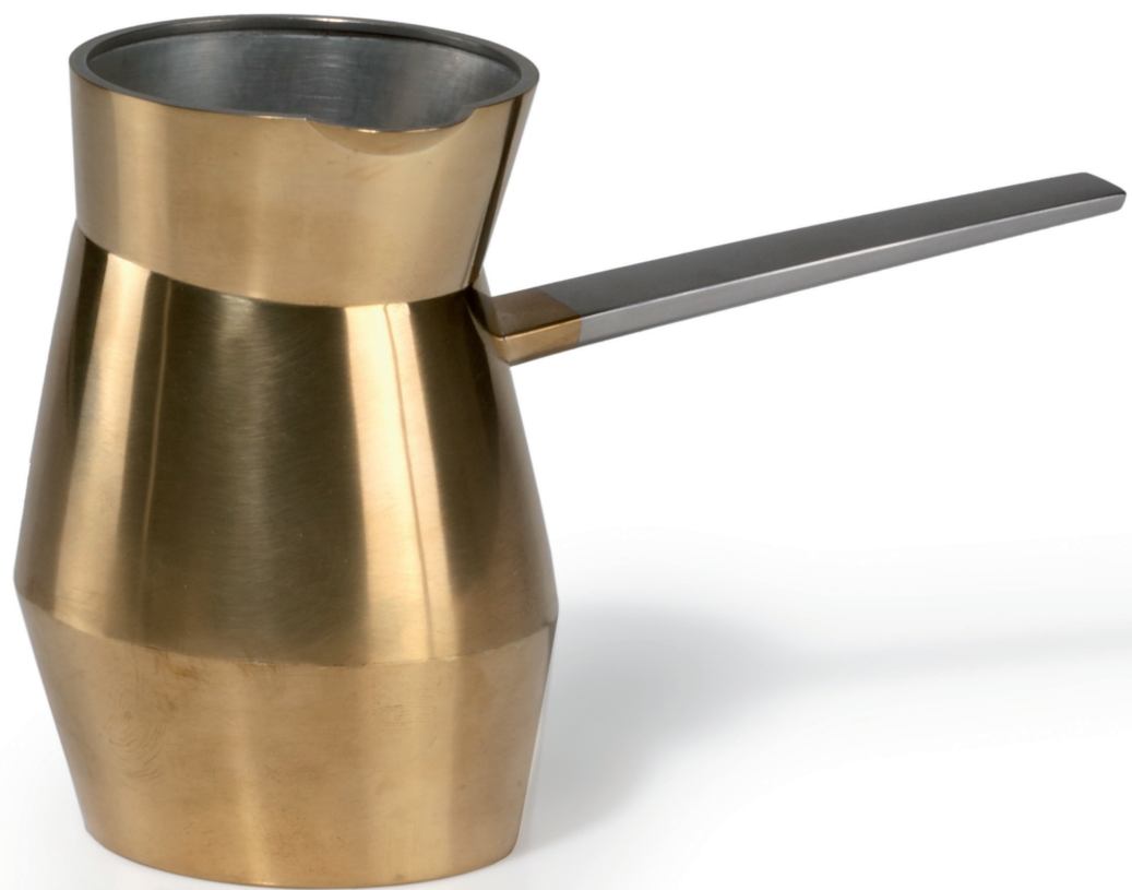
mocha pot, tumbac, inside tin-plated, stainless steel handle, h 14 cm