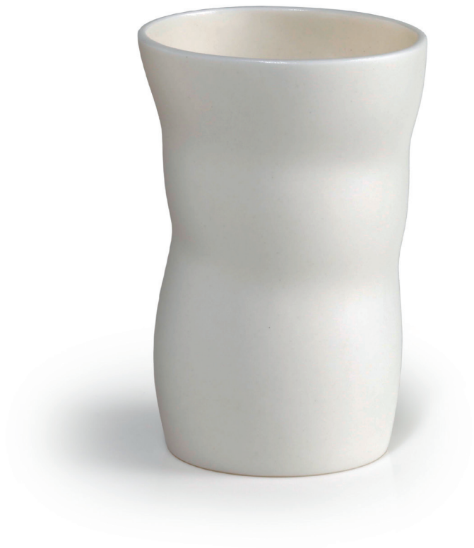
beaker; porcelain, h 10 cm