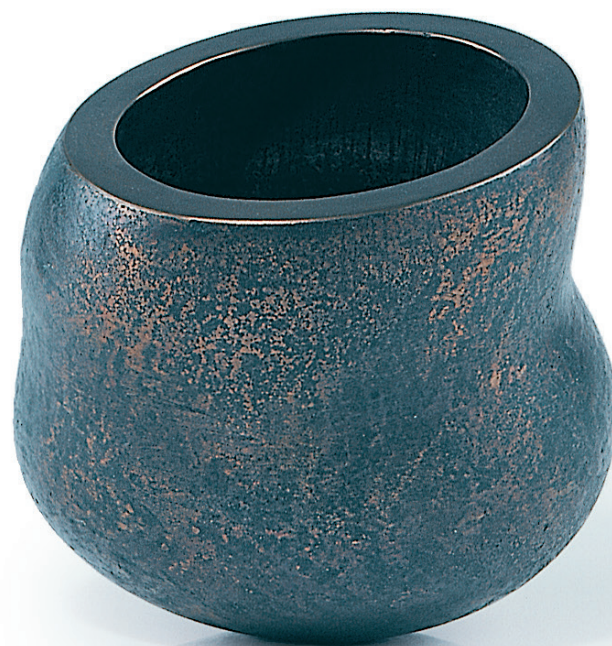
bowl, cast bronze, ø 19 cm