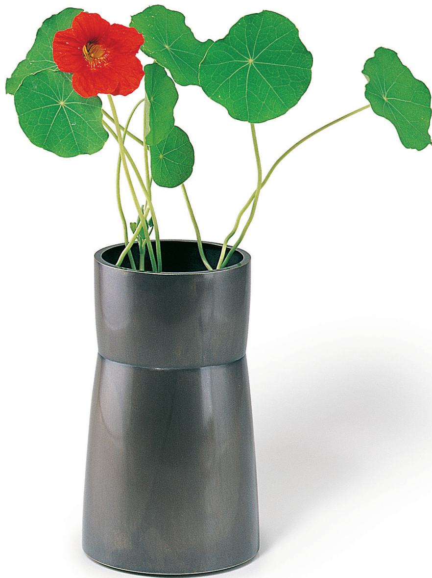
vase, tombac, h 20 cm