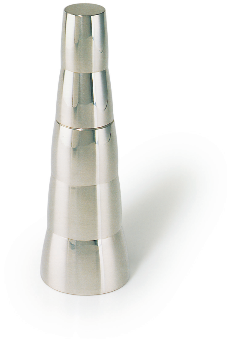
pepper mill, silver, h 16 cm