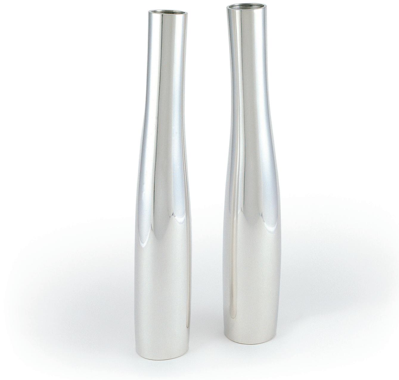
jugs, silver, h 30 cm