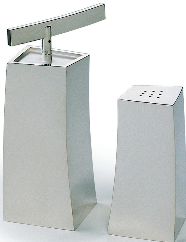
pepper mill, silver; h 12 cm salt shaker, silver, gold plated, h 8cm