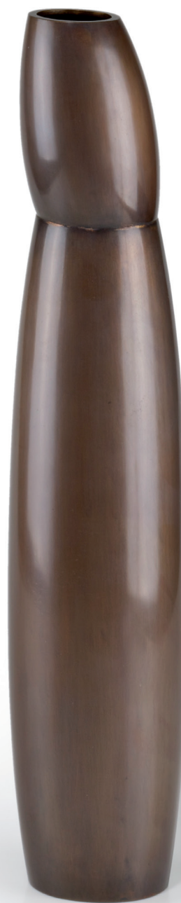
vase, tombac, h 35 cm