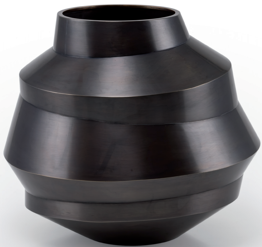
vase, tombac, h 25 cm