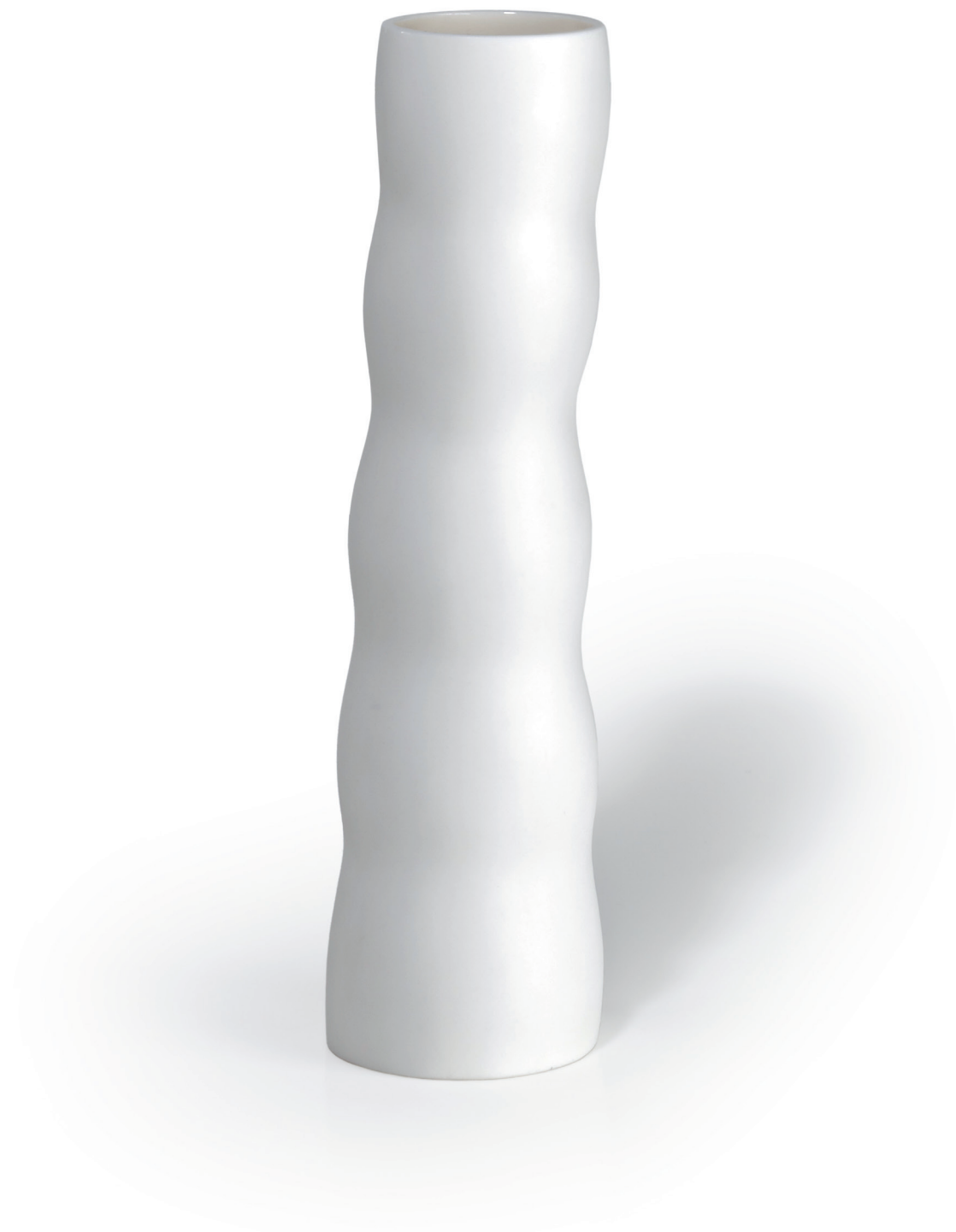
vase, porcelain, h 30 cm