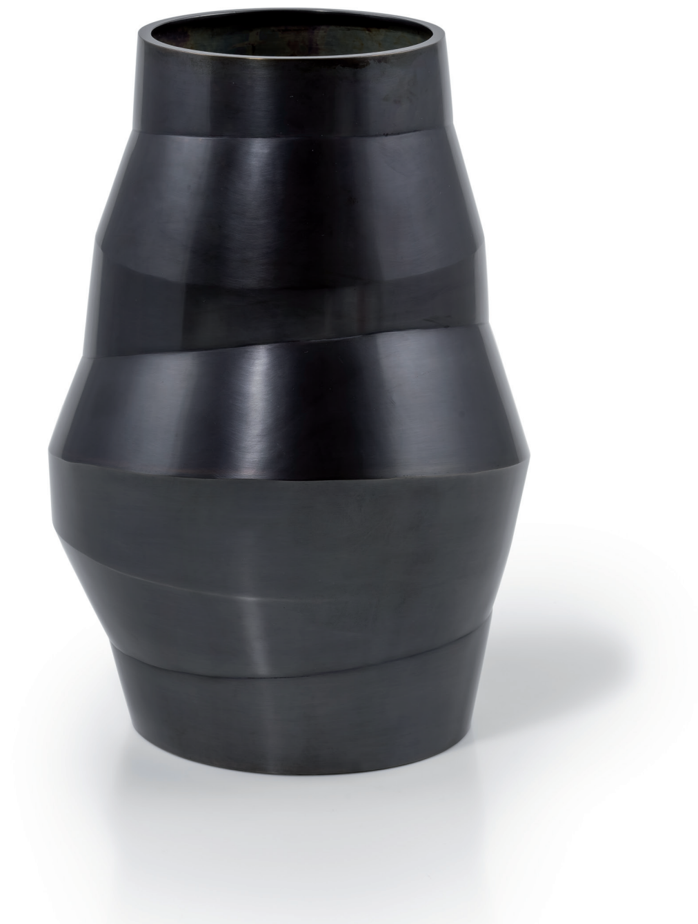
vase, tombac h 32 cm