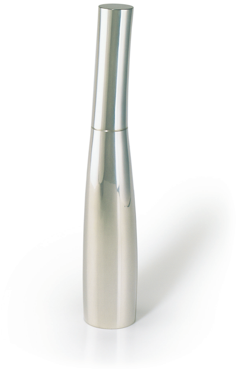
pepper mill, silver, h 27 cm