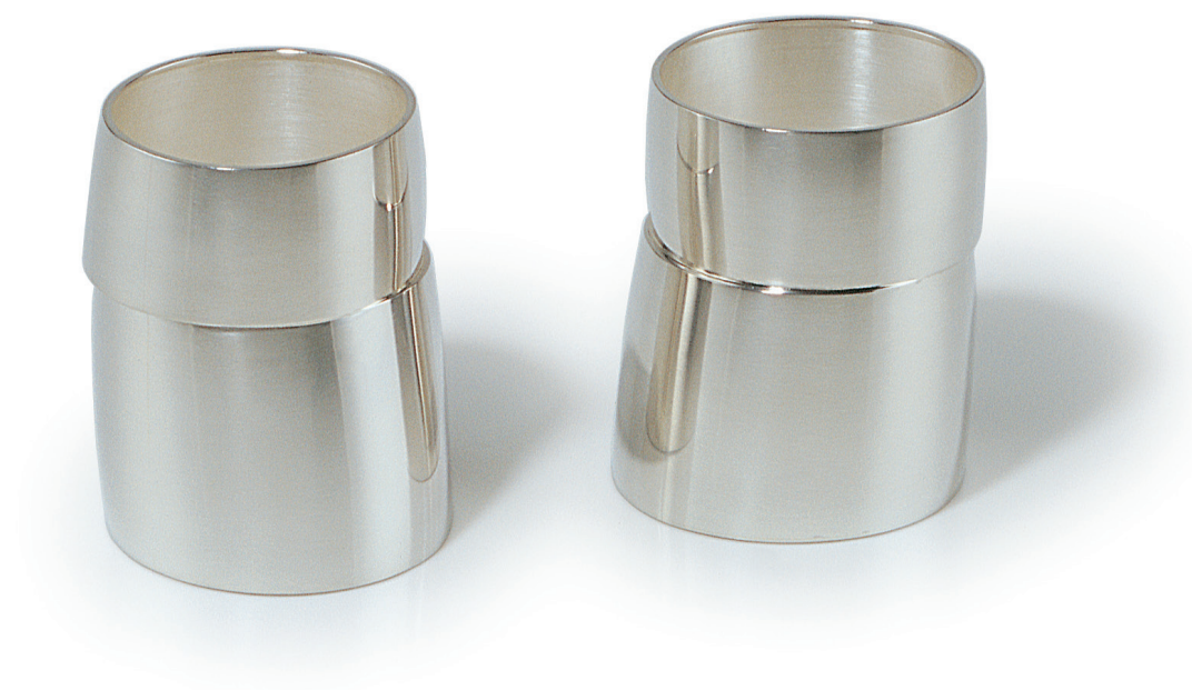
beakers, silver, h 7 cm