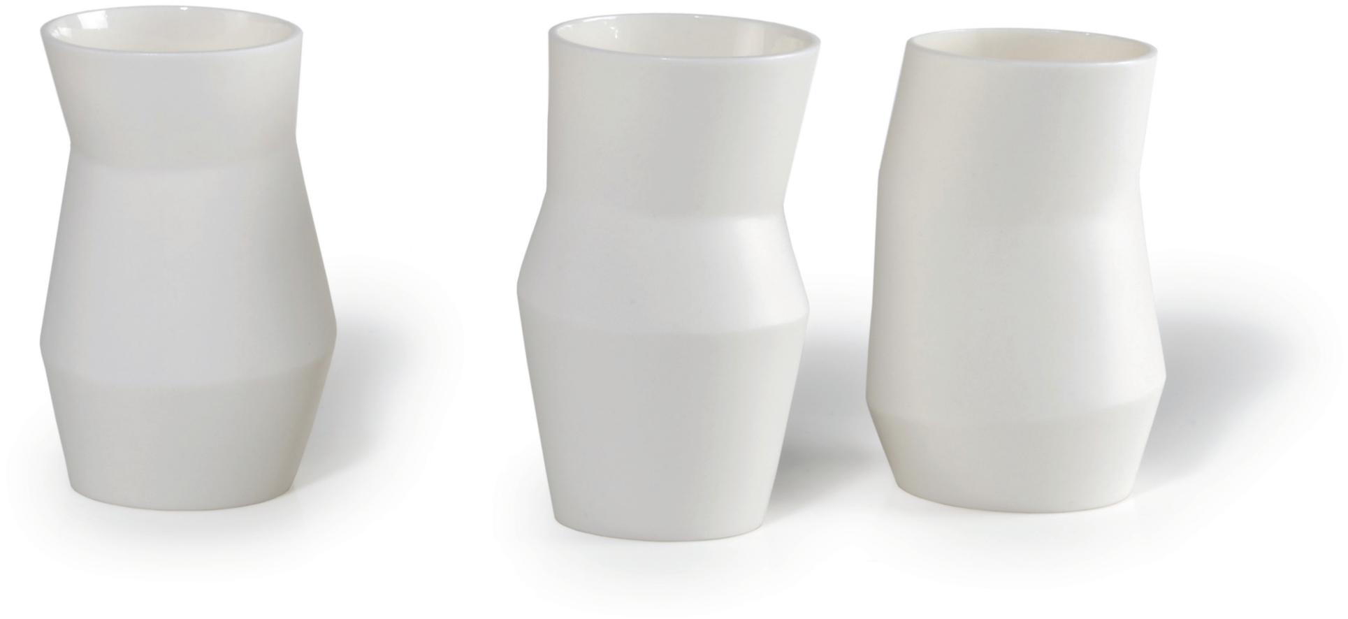
beakers, porcelain, h 10 cm