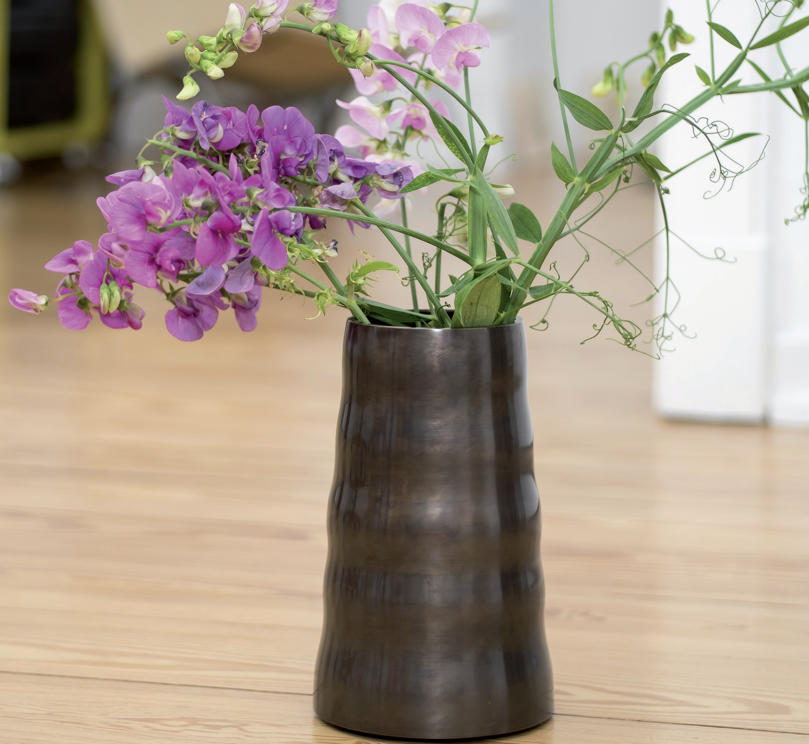
vase, tumbac, h 21 cm